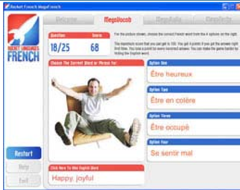
Screen shot of the Rocket French vocabulary learning game.

In the audio comprehension game, users play an audio clip of a word or phrase in the target language and select the corresponding word or phrase from six options displaying image and a translation.