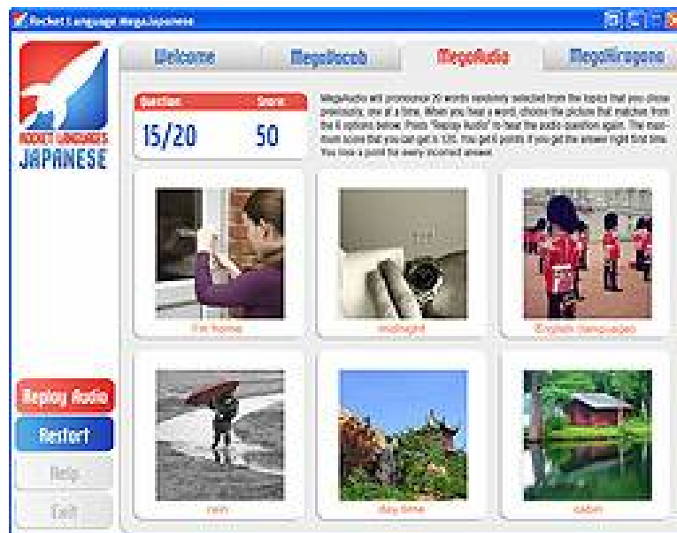
Screen shot of the Rocket Japanese audio comprehension learning game.

In the audio comprehension game, users play an audio clip of a word or phrase in the target language and select the corresponding word or phrase from six options displaying image and a translation.